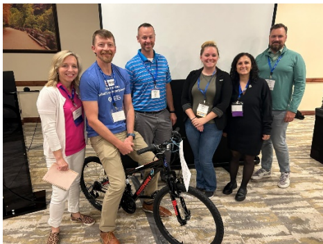
This Big Beautiful Bike

Attendees broke out into 8 teams to build bikes to give back to children in need in Utah. A few photos are provided below. Teams built their bike, created a name for their bike and did a jingle.