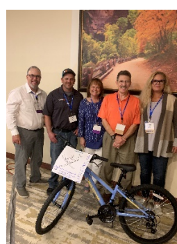
Free Ride Fiend