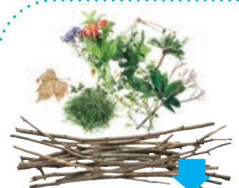
Plants, Trees, Soil, Mulch, Flowers