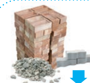
Concrete, Brick, Porcelain, Pavers, Asphalt