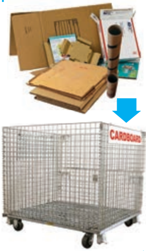
Corrugated Cardboard, Cardboard Tubes