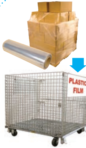
Film Plastic, Shrink Wrap, Bubble Wrap, Plastic Bags, Sheet Plastic Must Be Clean and Dry. No Strapping, Paper, Food Scraps.