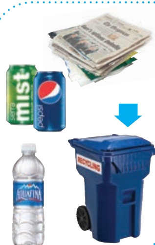
Plastic Beverage Bottles, Soda Cans, Paper and Newspapers Must Be Clean