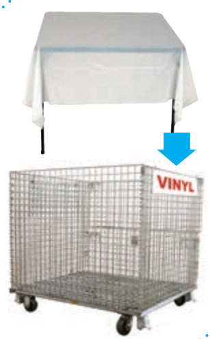
Vinyl tablecloths No Banners