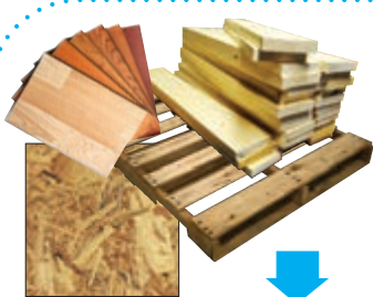
Lumber, Plywood, Particle Board, Scraps