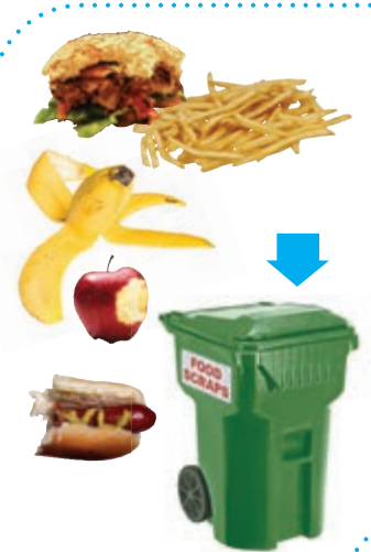
Food Scraps (Includes Meat, Bones, Dairy)