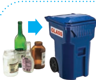
Glass Bottles and Jars Must Be Clean