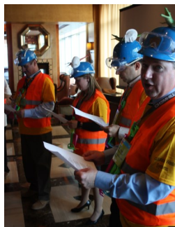
2016 Golden Manhole Inductees