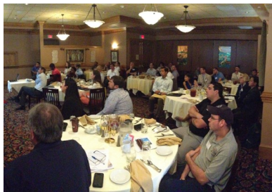
Participants at CWEA Spring Seminar.

CWEA's Collection Systems Committee recently completed their annual Spring Seminar on Wednesday, June 1, 2016 at Dutch's Daughter in Frederick, MD.