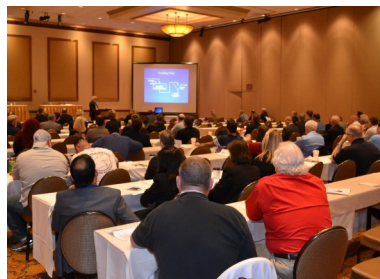
Participants in a technical session.