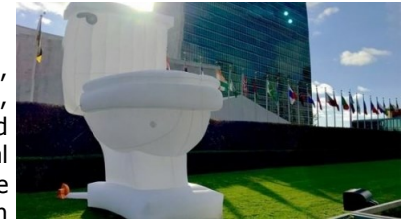
Inflatable toilet outside of the UN Building in New York City, NY.

If there's one thing that unites humanity, it's the call of nature. But depending on where we live, it's not always possible to dispose of our bodily waste safely and responsibly. November 19, 2017 marked this year's World Toilet Day! Established in 2001, World Toilet Day is recognized by the United Nations as an international observance day to inspire action against the global sanitation crisis. This global crisis, listed as Sustainable Development Goal #6 , affects more than 4.5 billion people who live without a household toilet. SDG #6 aims to have sanitation reach everyone, and to halve the proportion of untreated wastewater and increase recycling and safe reuse by 2030.