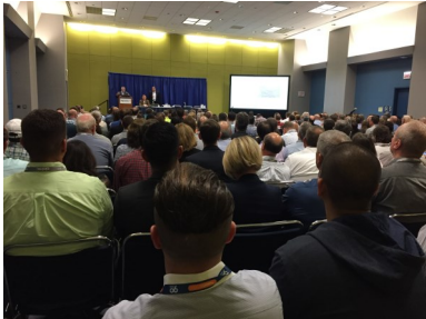
Standing room only for one of the Collection Systems Technical Sessions.

The Collection Systems sessions were once again successful at WEFTEC 2017! The track this year included 7 full sessions, 2 half sessions, and 2 joint sessions with Utility Management and Facility Operations. Private property continued to be a popular topic at WEFTEC 2017. The attendance at our mobile session on Lateral Rehabilitation - Technology Effectiveness Comparison