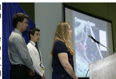
Students presenting at WEFTEC 2017

This year's meeting included an added overlaid item of interest – Live Polling during the meeting. Several questions were posed to attendees with responses via text messaging, utilizing the Poll Everywhere app. Tabulated results were live displayed and then later assigned for discussion in small groups during the afternoon roundtable discussion. Results and discussion report-outs will provide important input for committee leadership to further refine the committee's mission, level of engagement, succession and growth planning.