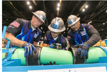
Division 1 winners TRA CreWSers, during the collection systems event

Click here to learn more about the WEF Student Design Competition.