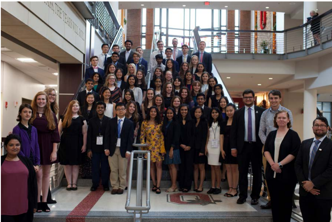
Student participants with coaches, The Ohio State University 2019.