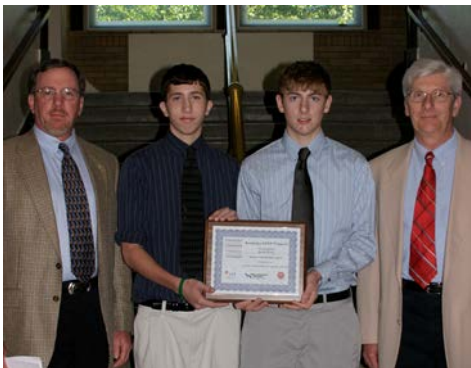
KY/TN WEA volunteers honor their state winners with an awards presentation, which can be a great photo and press opportunity for their local MA.

Shortly after the winner's announcement, each MA will receive a certificate for presentation at their winner's school. This helps promote the student's achievement and presents a photo opportunity that is likely of interest to the local press.