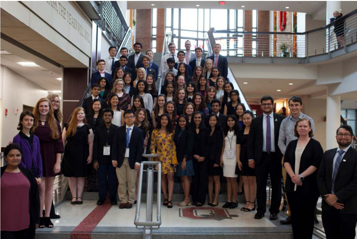
Student participants with coaches, The Ohio State University 2019.