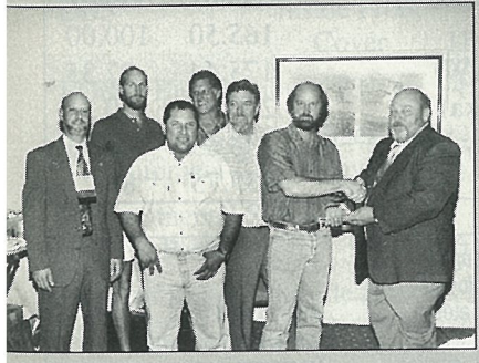
Portraits of excellence: Division I second place winners, HRSD; Division I third place winners, Synergetics; and Division II first place winners, Wastewater Warriors (from top to bottom).