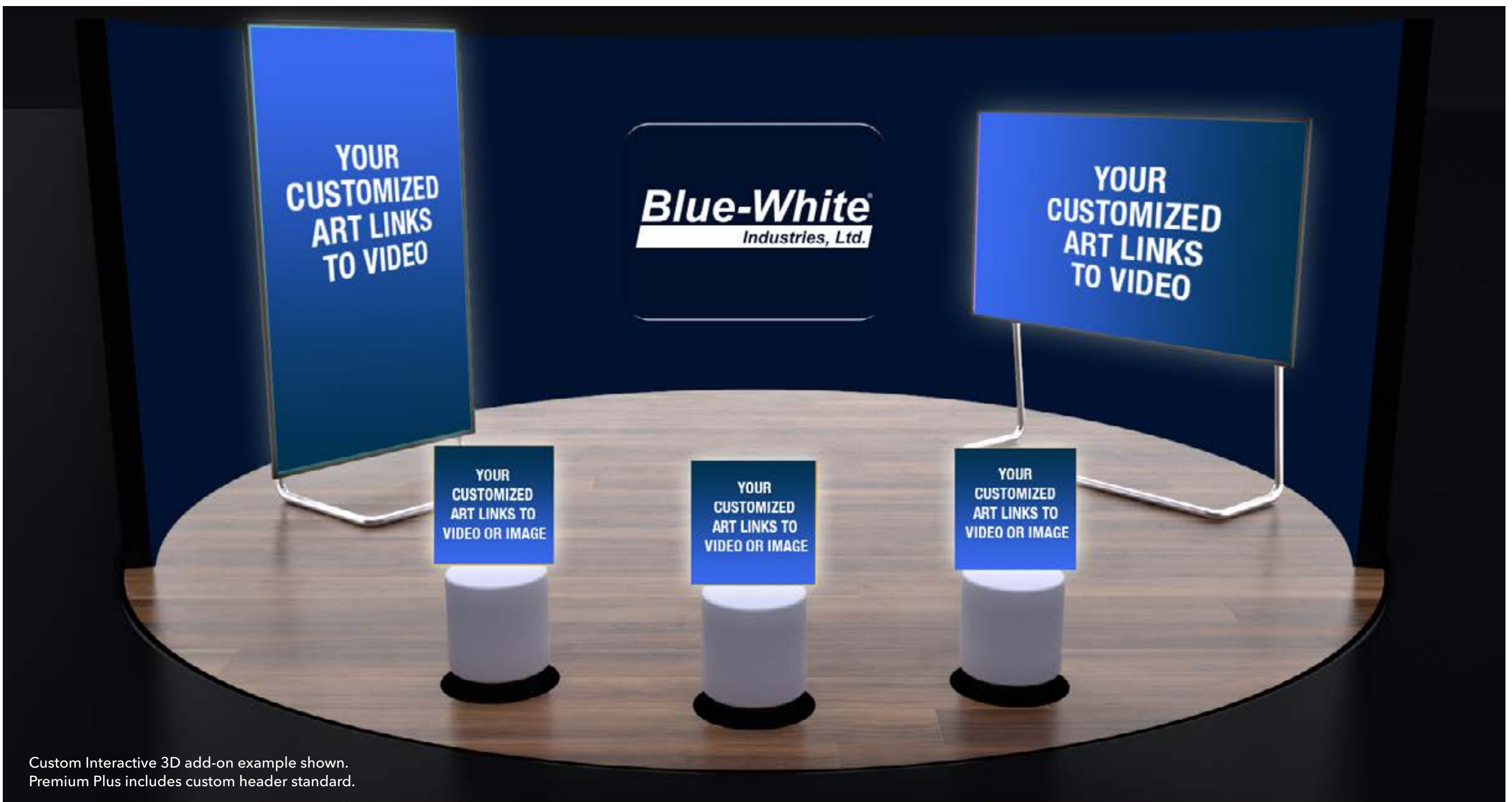
Custom Interactive 3D add-on example shown. Premium Plus includes custom header standard.