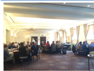
CSC Members during the round table discussions on how to help mentorship programs.

Chesapeake Chesapeake to participants (17-24 old). The program has been greatly successful but can grow and improve. round table discussion looked at four questions: What can CSC/WEF/MAs do