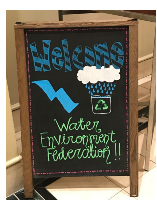
Welcome sign at the Grand Hyatt Atlanta in Buckhead