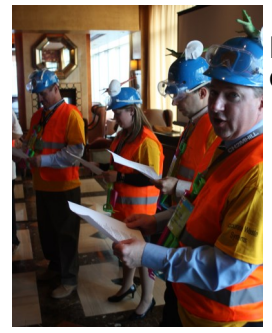
2016 Golden Manhole Inductees