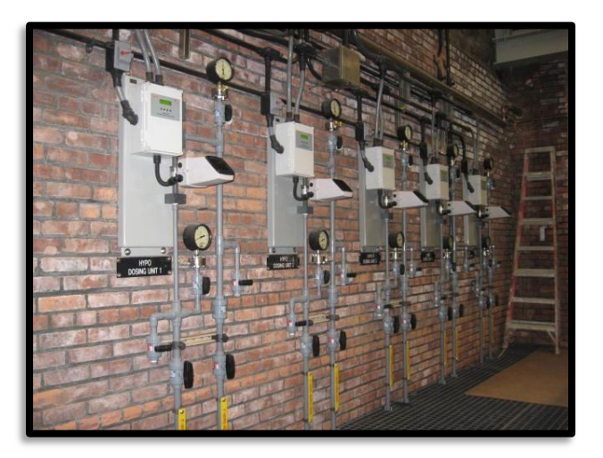
JCS Industries, Inc., Model 4100 Liquid Vacuum Doser