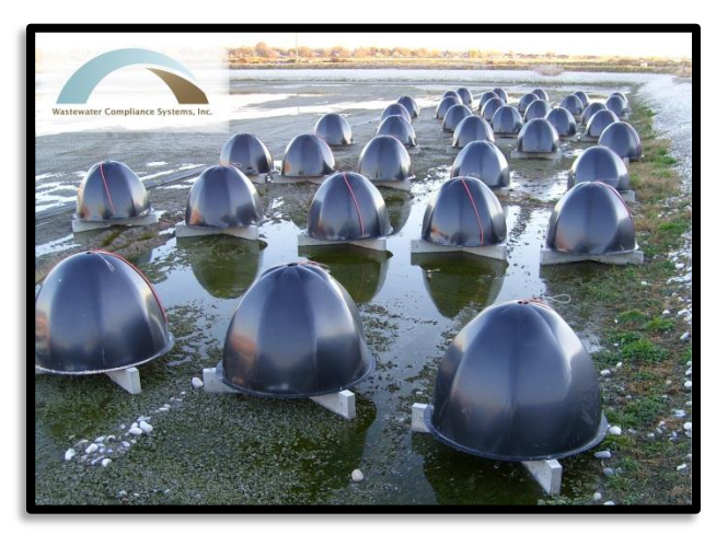
Wastewater Compliance Systems, Inc. Bio-Domes