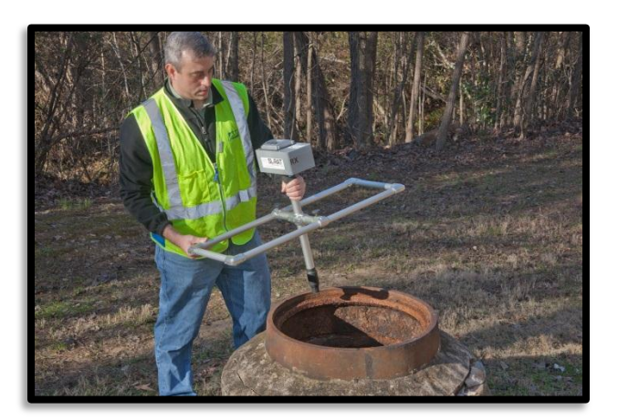
The Sewer Line Rapid Assessment Tool, aka the SL-RAT, from InfoSense, Inc.

The Model 4100 Liquid Vacuum Doser also integrates with SCADA, and feedrates can be monitored and adjusted from the control room. The feeder automatically regulates with several modes including fixed rate, flow paced, residual control and compound loop.